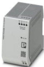
Primary-switched UNO POWER power supply for DIN rail mounting, input: 1-phase, output: 12 V DC/100 W

Please be informed that the data shown in this PDF Document is generated from our Online Catalog. Please find the complete data in the user's documentation. Our General Terms of Use for Downloads are valid ( http://phoenixcontact.com/download )