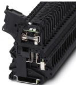
Lever-type fuse terminal block, black, for 5 x 20 mm G fuse inserts, with LED for 24 V AC/DC

Please be informed that the data shown in this PDF Document is generated from our Online Catalog. Please find the complete data in the user's documentation. Our General Terms of Use for Downloads are valid ( http://phoenixcontact.com/download )