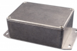
Spot-welded bottom flange