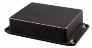
Wall-mounting flange integrated into lid.