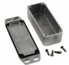
Water-tight versions and gasket upgrades available for most sizes.