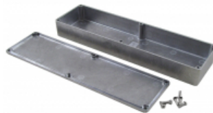
Lap joint construction where lid and box meet.