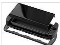
Mounting lid with infrared-permissive plastic cap