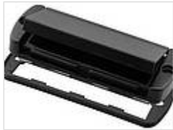
Mounting lid with hinged aluminium flap