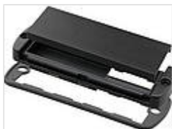
Mounting lid with removable aluminium cap and compartment for 9V block battery