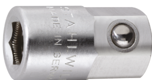
11180020 Bit holder