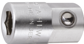
11180020 Bit holder