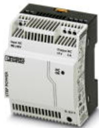
Primary-switched STEP POWER power supply for DIN rail mounting, input: 1-phase, output: 12 V DC/5 A

Please be informed that the data shown in this PDF Document is generated from our Online Catalog. Please find the complete data in the user's documentation. Our General Terms of Use for Downloads are valid ( http://phoenixcontact.com/download )