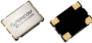
7.0 x 5.0mm Ceramic SMD