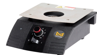
PCT-100 Pre-heater Convection Tool