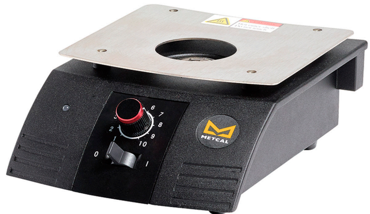
Rework small boards directly on the PCT-100

The PCT-100 can be used with or without a board holder. An Arm Rest is also available to steady your hand and keep your arm from being fatigued. The board holder and arm rest are available as a complete kit, with the PCT-100, or they can be purchased separately.