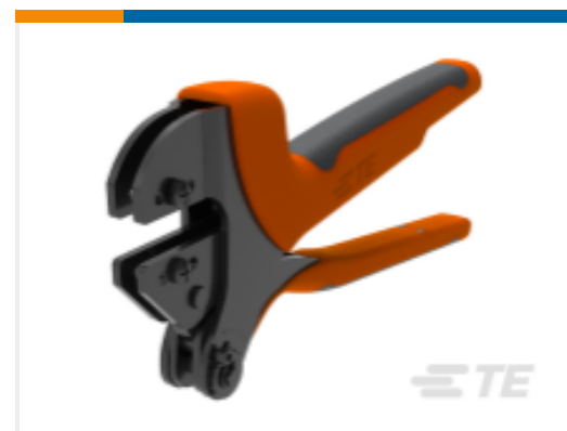
TE Part # 2362810-1 SDE CRIMP HAND TOOL FRAME W /O DIES