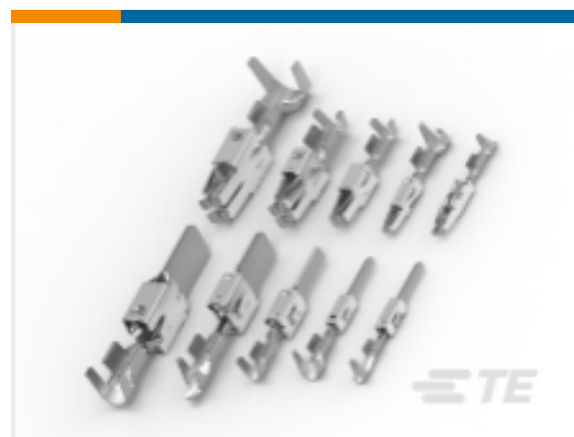
TE Part # CAT-T4827-T273 TIMER, RECEPTACLE AND TAB