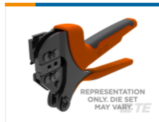
TE Part # 2393700-1 SDE F POWER TIMER 0.50-1.00 ASSY REPRESENTATION ONLY. DIE SET MAY VARY.