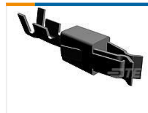
TE Part # 964283-2 JPT A REC 2.8 Contact SWS Sn (LP)