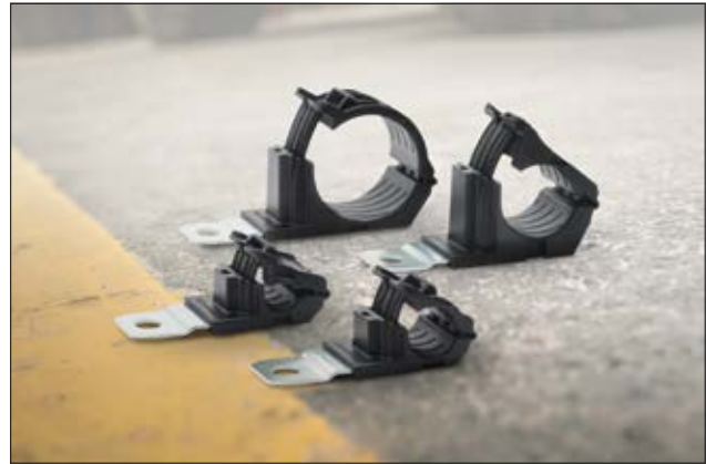
Ratchet P-Clamps in multiple configurations to handle a wide range of diameters and applications.