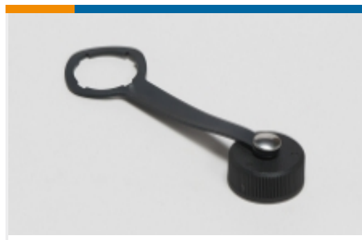
Modular Jack & Plug Caps & Covers(3)