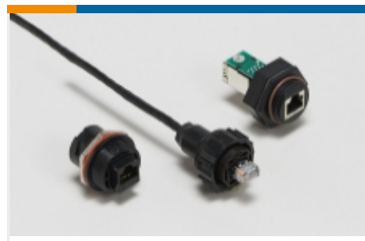
Circular RJ45 Connectors(8)