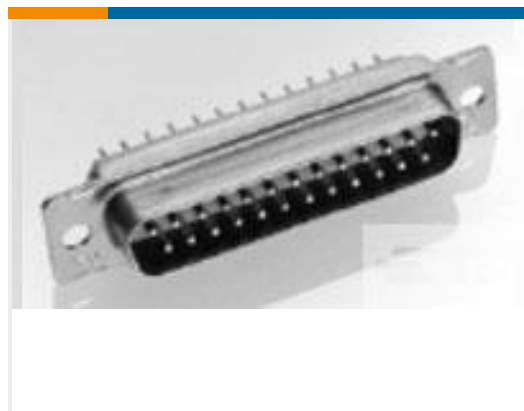
TE Part #1757820-2 AMPLIMITE,ASY,RCPT, STD,109,ZN,2