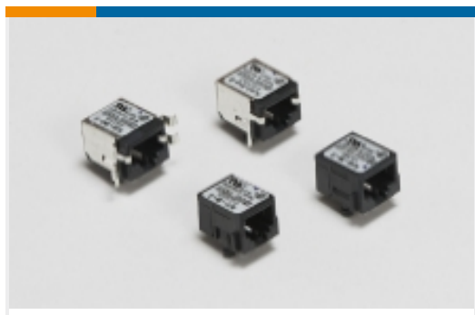
Modular Jack Filters(1)