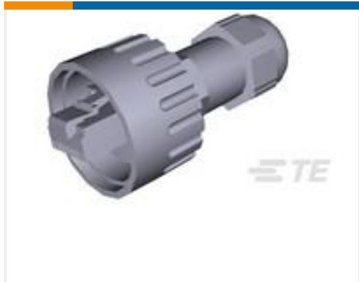
TE Part #1546440-1 ETHERNET FIELD ATTACHABL CONN