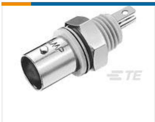
TE Part #5227726-1 ISOLATED BNC SOLDER JACK ASSY