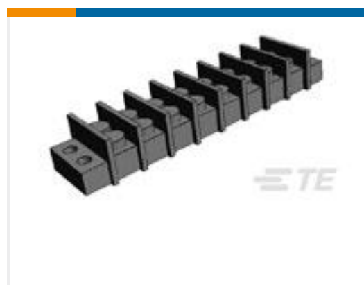
TE Part #1546306-8 8P .374" DR BARRIER STRIP