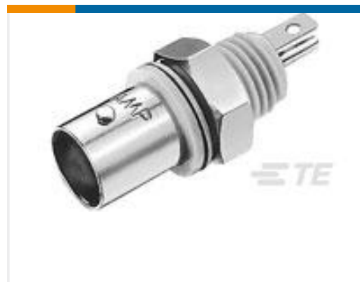
TE Part #5227726-2 ISOLATED BNC SOLDER JACK ASSY