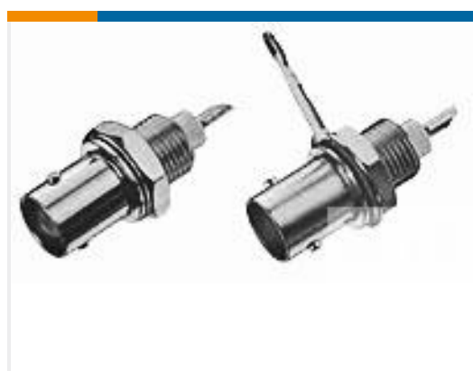
TE Part #227755-1 BNC SOLDER RECEPT JACK SHORT