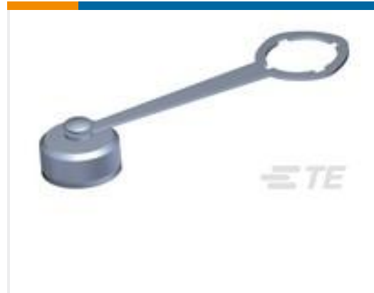
TE Part #1-1546406-1 ETHERNET CLOSURE CAP RECPT W/LANYRD