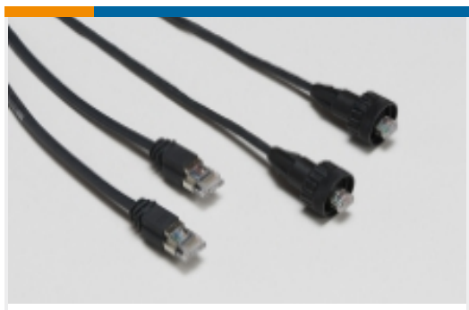
Modular Twisted Pair Cable Assemblies(4)