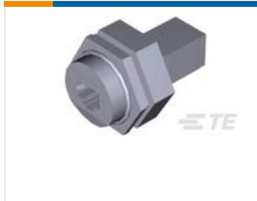
TE Part #1546413-3 ETHERNET RJ-45 BLKHD PASSTHRU