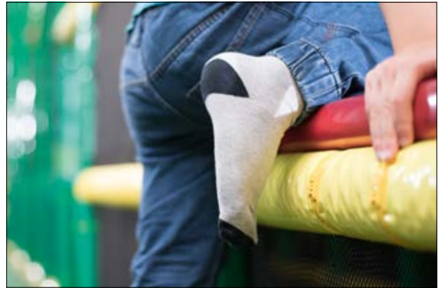
Low profile cable ties are minimising the risk of injury and simultaneously taking it easy on the material.