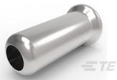
TE Part #5-5330808-6 SOCKET,MIN-SPR W/H SN-AU SER-1