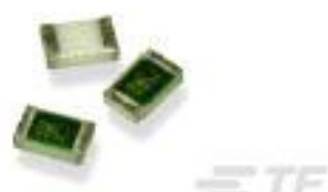
TE Part #7-1879338-3 CPF 0603 150K 1% 50PPM 1K RL