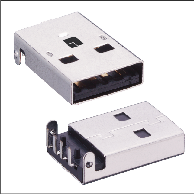
USB 2.0 chassis plug type A, angular version, for printed circuit boards