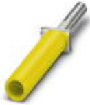
Female test connector, color: yellow

Female test connector - PSBJ-URTK/S YE - 0311731