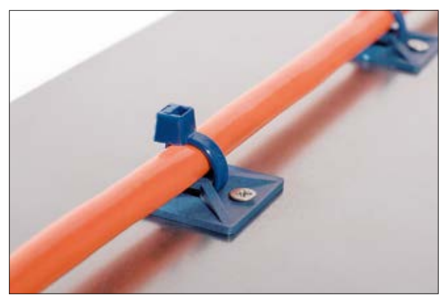
Detectable fixing solution containing of MCMB mount and MCT cable tie.