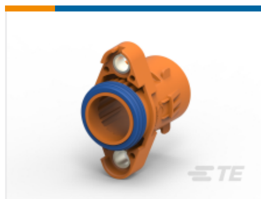
TE Model / Part #4-1991226-2 1 POS. RING TONGUE HOUSING ASSY. IPT 16-