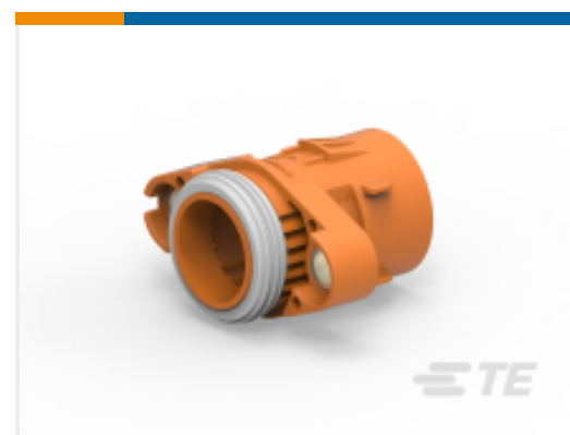
TE Model / Part #6-1991226-2 1 POS. RING TONGUE HOUSING ASSY. IPT 16-