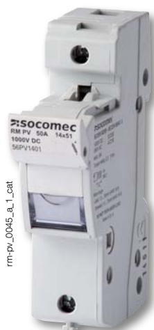
RM PV 14 x 51 50 A