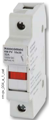
RM PV 10 x 38 32 A