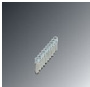
Fixed bridge, pitch: 5.2 mm, color: silver

Please be informed that the data shown in this PDF Document is generated from our Online Catalog. Please find the complete data in the user's documentation. Our General Terms of Use for Downloads are valid ( http://phoenixcontact.com/download )