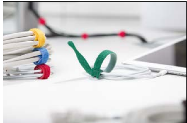
Due to the functional cable tie design the TEXTIE is fixed on the cable and can't get lost.