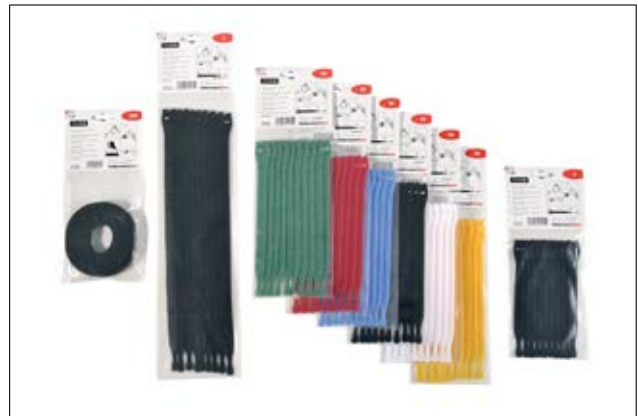
The TEXTIE-Series is available in different colours and lengths.

Material specification please see page 26.