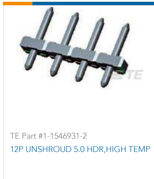
TE Part #1-1546931-2 12P UNSHROUD 5.0 HDR,HIGH TEMP