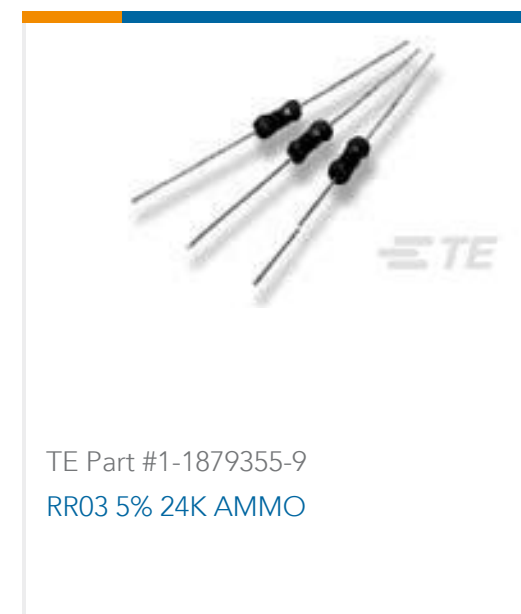
TE Part #1-1879355-9 RR03 5% 24K AMMO