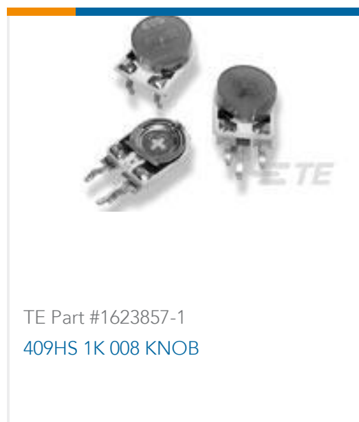
TE Part #1623857-1 409HS 1K 008 KNOB