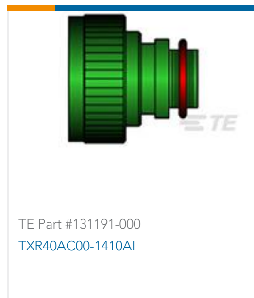
TE Part #131191-000 TXR40AC00-1410AI