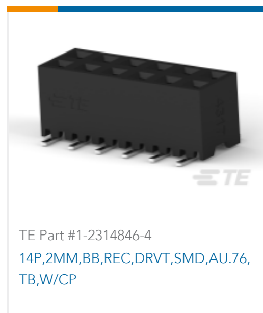
TE Part #1-2314846-4 14P,2MM,BB,REC,DRV,T,SMD,AU.76, TB,W/CP