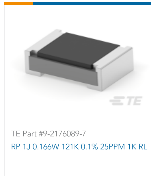
TE Part #9-2176089-7 RP 1J 0.166W 121K 0.1% 25PPM 1K RL