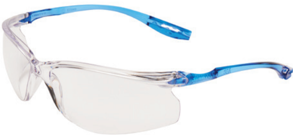
71511-00000 Lens: Clear