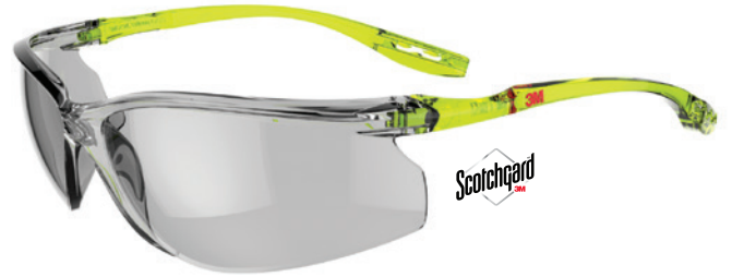
SCCS07SGAF-GRN Lens: I/O Grey