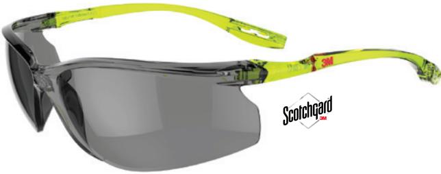
SCCS02SGAF-GRN Lens: Grey