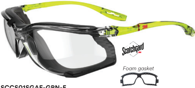
SCCS01SGAF-GRN-F Lens: Clear