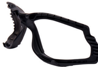
71511-99999 Foam insert