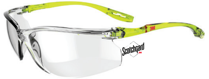
SCCS01SGAF-GRN Lens: Clear