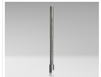
WB3032MIL - Wire Wrapping Bit, 30-32 AWG