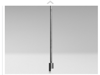
SB30MSH-B - Wire Wrapping Bit, 30 AWG