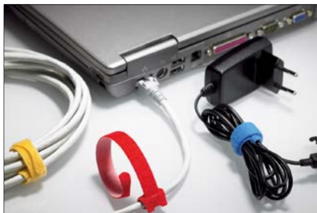
Due to the functional cable tie design the TEXTIE is fixed on the cable and can't get lost.