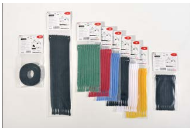
The TEXTIE-Series is available in different colours and lengths.