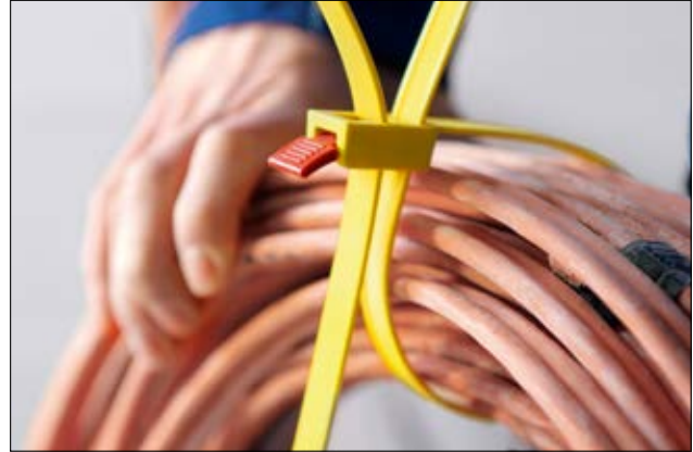
Excess Tails can be neatly tucked away.