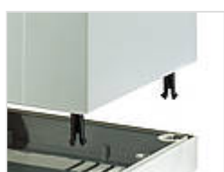
Quick-release fastener for EG 12.. - 20.., polyamide