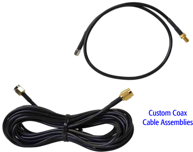
Custom Coax Cable Assemblies