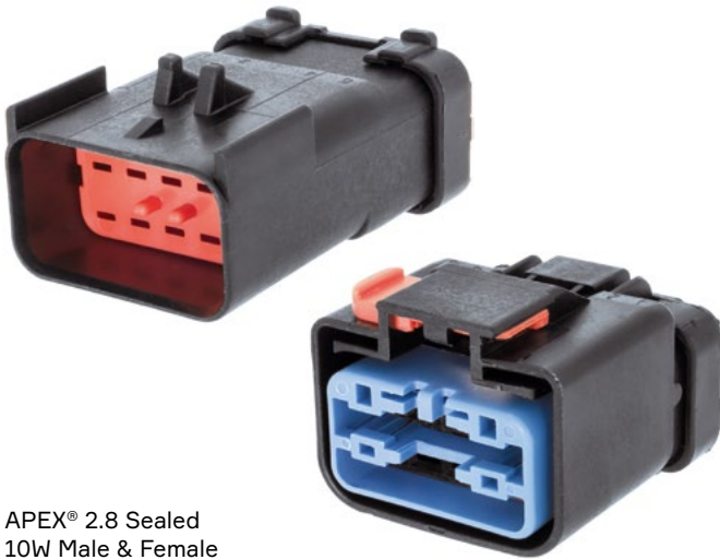
APEX ® 2.8 Sealed 10W Male & Female