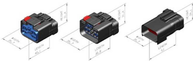
APEX® 2.8 Sealed 10W Female pre-assembly