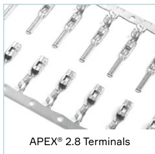
APEX® 2.8 Terminals

Part numbers, specifications, dimensions and performance data in this document are for general references only and are subject to change without notice. To verify product information, please contact an Aptiv representative.