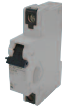
Add-on Neutral Pole