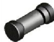
SURFACE MOUNT LL34