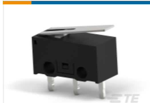
TE Model / Part # 2351445-4 UMINSA SW HLV0.88N 3A /1.5A AC SC PCB