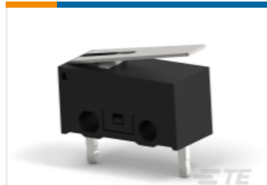
TE Model / Part # 2351445-5 UMINSA SW HLV0.88N 3A /1.5A AC NC PCB