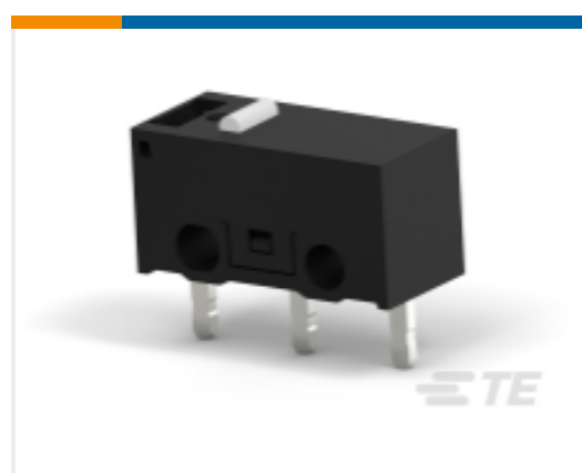
TE Model / Part # 2351444-1 UMINSA SW PPLUN 0.74N 0.1A/30VDC SC PCB