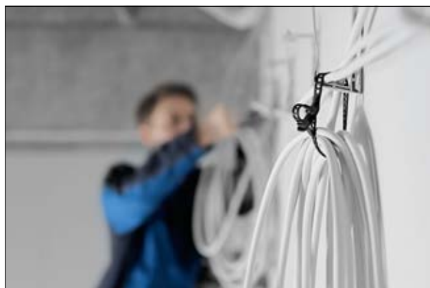
The elasticity of the SOFTFIX ties makes them suitable for use in many applications.