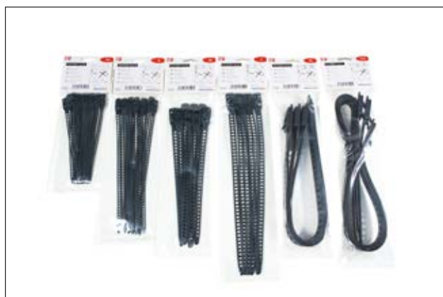
SOFTFIX ties available in small packaging units.