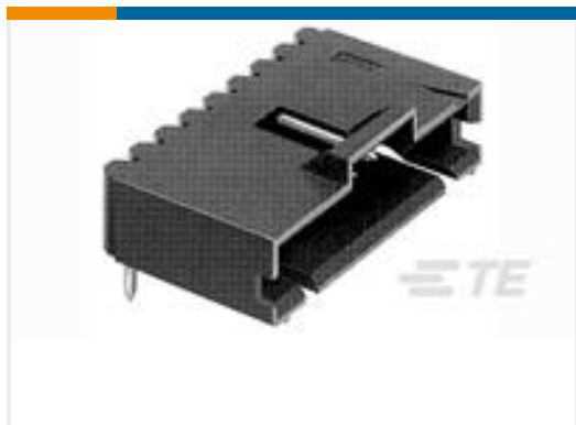
TE Part #5-103634-4 05 MTE HDR SRRRA LATCH.100CL LF TRAY