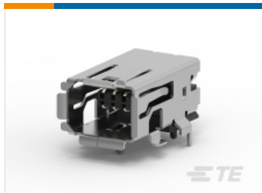
TE Part #2294415-1 INDUSTRIAL MINI I/O HDR TYPE I TRAY