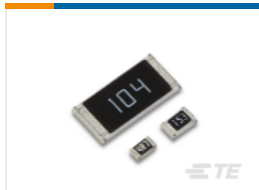
TE Part #2176347-5 CRGCO 2010 22R 1%