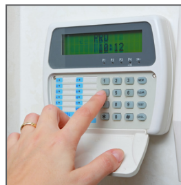
Alarm and Monitoring Systems