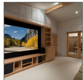
Home Entertainment Systems