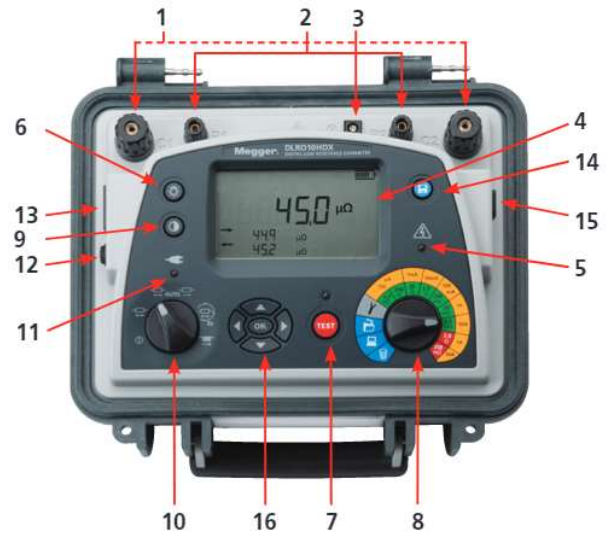
DLRO10HDX Instrument Overview