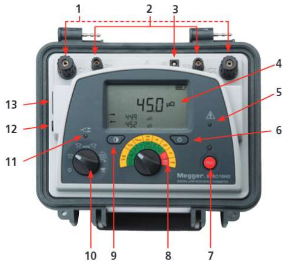
DLRO10HD Instrument Overview