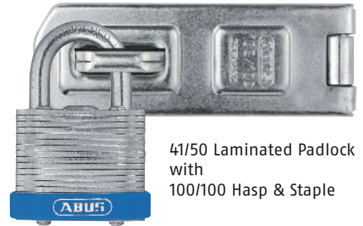
41/50 Laminated Padlock with 100/100 Hasp & Staple

Master keyed Available 10mm Bitted Available