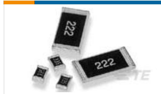
TE Model / Part #1623163-1 CRG0805 1% 24K