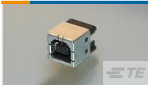
TE Model / Part #1734346-4 STD USB TYPE B, R/A, SMT, WHITE