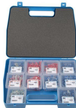
Plasti-Grip Terminal Kit (278-9395)