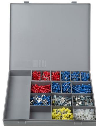
Plasti-Grip Repair Kit (243-1046)