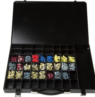
PIDG Repair Kit (414-6611)