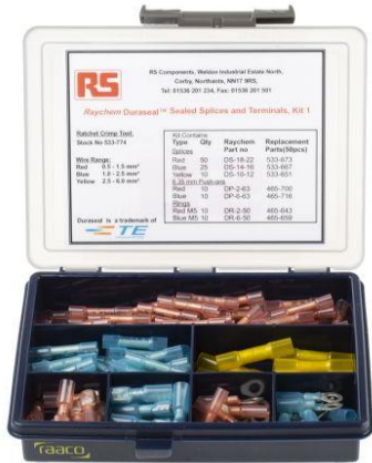
Service & Repair Kit (408-9681)