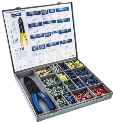
Automotive Service Kit 1 (414-6633)