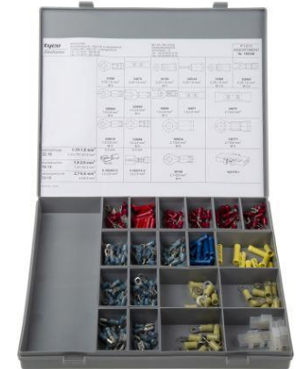
PIDG Intro Service Kit (243-1052)