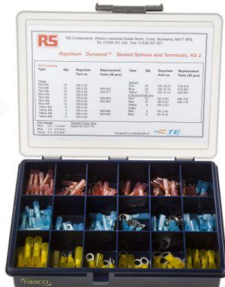
Service & Repair Kit 2 (408-9697)