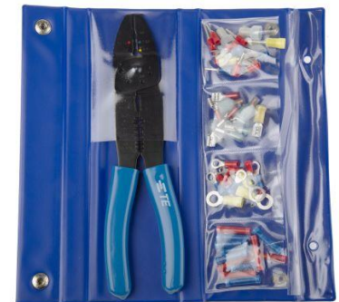
Service & Repair Kit (175-6754)