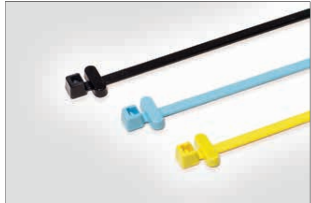
T50RFID – cable ties with RFID transponder.