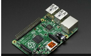
Raspberry Pi Model B+