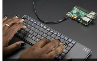
Full Size Wireless Keyboard