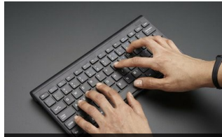
Mini Wireless Keyboard -