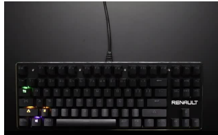
Keyboard with Blue-type