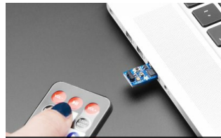
Adafruit piRkey - a Python