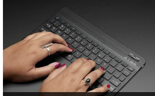
10" Bluetooth Keyboard -