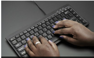
Mini Chiclet Keyboard - USB