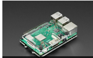
Adafruit Pi Protector for