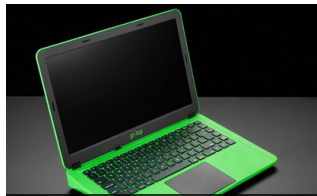
pi-top Laptop with Inventor's