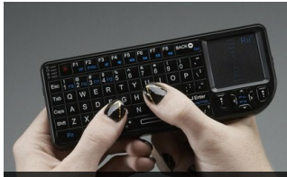
Miniature Wireless USB