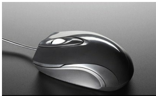
USB Wired Mouse - Two