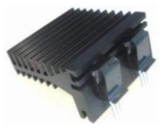
SLOT FOR DEVICE CLIP