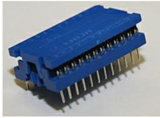
Item # CWR-130-14-0000, DIP Connectors