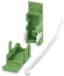
Cable housing, pitch: 0 mm, number of positions: 2, dimension a: 10 mm, color: green

Please be informed that the data shown in this PDF Document is generated from our Online Catalog. Please find the complete data in the user's documentation. Our General Terms of Use for Downloads are valid ( http://phoenixcontact.com/download )