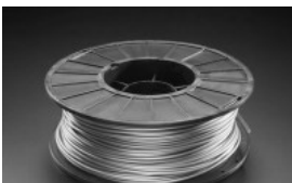
PLA Filament for 3D