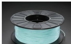
PLA Filament for 3D