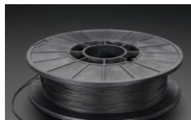
NinjaFlex - 1.75mm Diameter