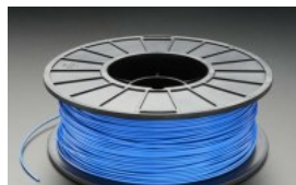
PLA Filament for 3D