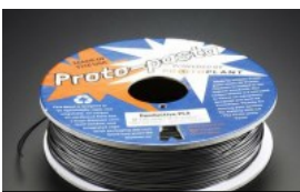
Proto-Pasta - 1.75mm 500g