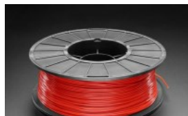
PLA Filament for 3D