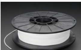
NinjaFlex - 1.75mm Diameter