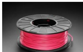
PLA Filament for 3D