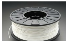
ABS Filament for 3D