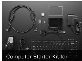
Computer Starter Kit for