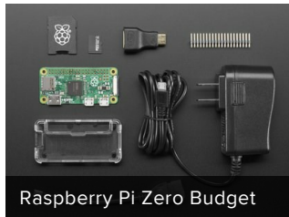
Raspberry Pi Zero Budget