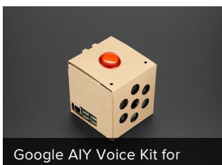
Google AIY Voice Kit for