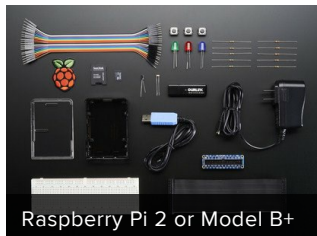
Raspberry Pi 2 or Model B+