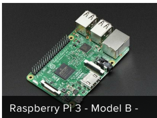
Raspberry Pi 3 - Model B -