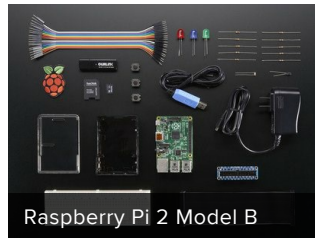
Raspberry Pi 2 Model B