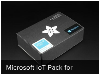
Microsoft IoT Pack for