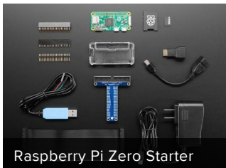
Raspberry Pi Zero Starter