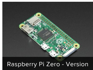
Raspberry Pi Zero - Version