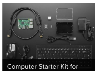
Computer Starter Kit for