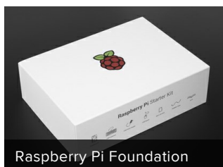
Raspberry Pi Foundation