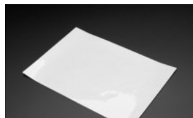
Hydro Dipping Sheets – 10