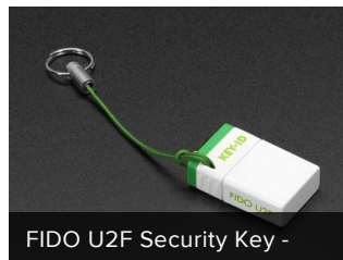
FIDO U2F Security Key -