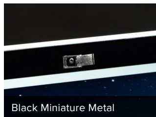
Black Miniature Metal