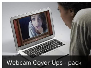
Webcam Cover-Ups - pack