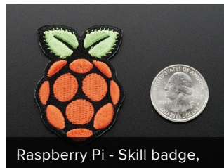
Raspberry Pi - Skill badge,