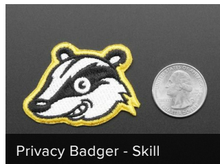
Privacy Badger - Skill