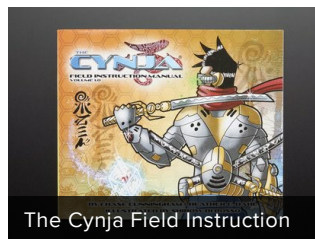
The Cynja Field Instruction