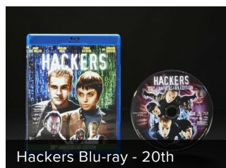
Hackers Blu-ray - 20th