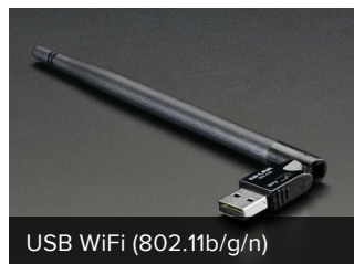
USB WiFi (802.11b/g/n)