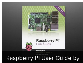
Raspberry Pi User Guide by