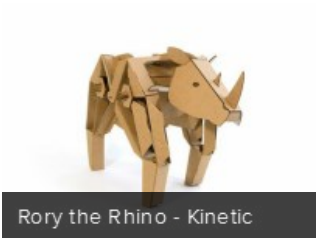
Rory the Rhino - Kinetic