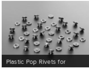
Plastic Pop Rivets for