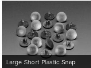
Large Short Plastic Snap