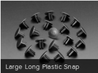
Large Long Plastic Snap